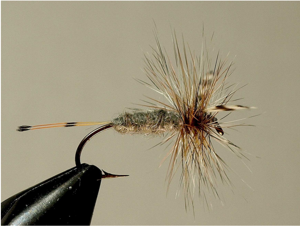
Tied to the original Halladay pattern using gray wool yarn.

It is safe to assume that Halladay tied and sold the fly and also shared it with the customers he guided. The fly gained popularity quite quickly. Although we do not have an exact date or location; within just a couple of years the first modification of the Adams took place. Tiers began replacing the gray wool yarn with muskrat fur. For all practical purposes the color is the same but the floatability increased. The wings, hackle and tail remained unchanged.