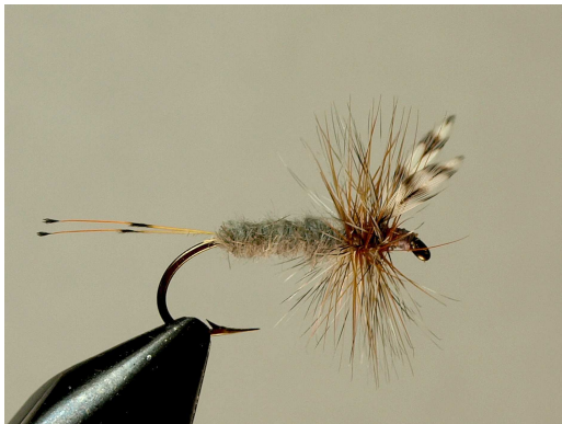
Tied with muskrat fur.

It is safe to assume that Halladay tied and sold the fly and also shared it with the customers he guided. The fly gained popularity quite quickly. Although we do not have an exact date or location; within just a couple of years the first modification of the Adams took place. Tiers began replacing the gray wool yarn with muskrat fur. For all practical purposes the color is the same but the floatability increased. The wings, hackle and tail remained unchanged.