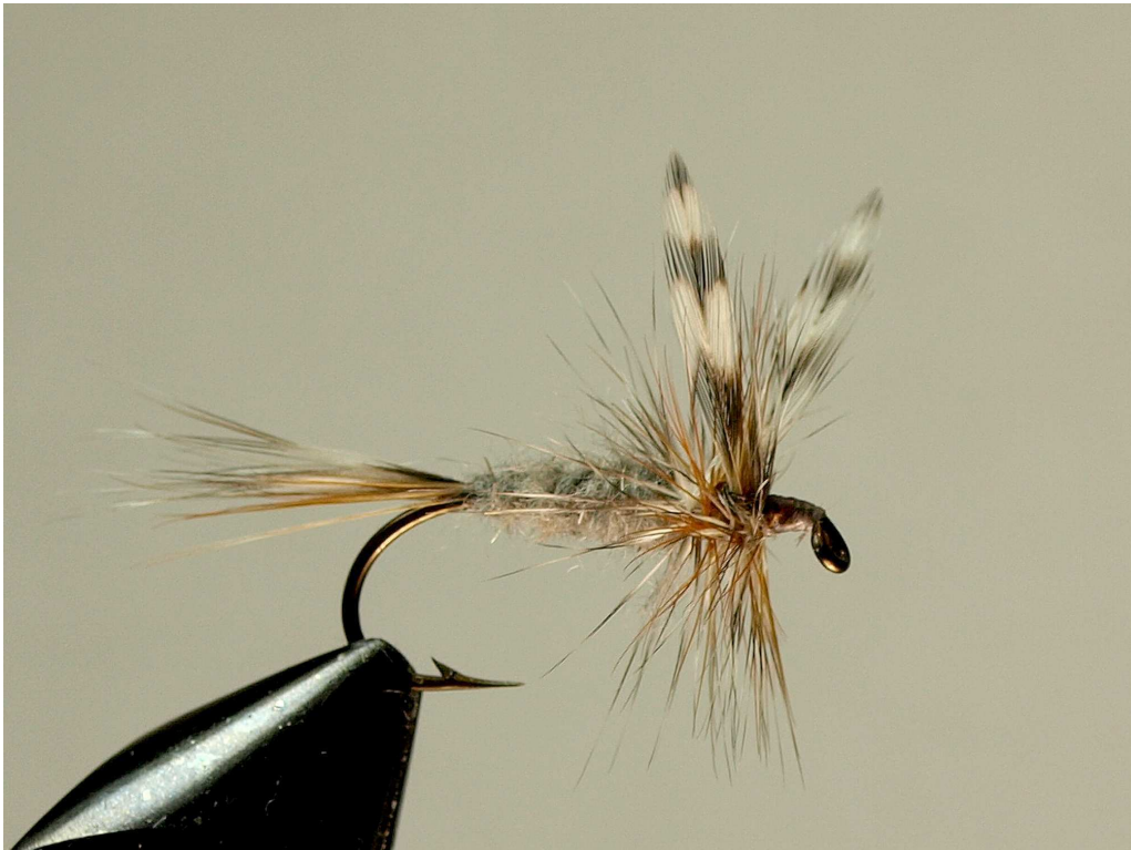
Modern day rendition.

The reform of the tail from two golden pheasant tippets to a tail of mixed grizzly and brown hackle fibers is the last major metamorphosis of the Adams. We do not have an exact date or the name of the tier who first altered the tail. We are not even sure from which part of the country the modification started. What we do know is that the original tail began to disappear and be replaced with the new material as early as 1938.