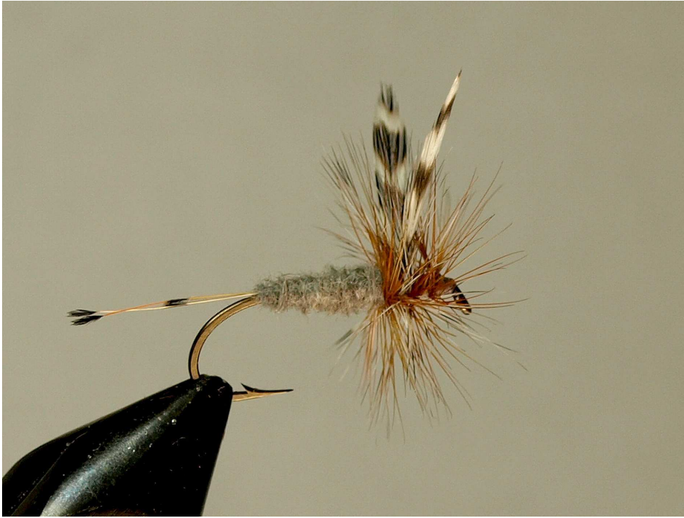
The taking on of the Catskill influence.

As the fly continued to grow in popularity its reputation was spreading further and further from its point of origin. Some time in the late 20's or very early 30's the Catskill tiers influenced the next modifications: the wings were pulled back from the 'advanced' position and they went from 'semi-spent' to upright and divided. The body was well trimmed and tapered in the typical Catskill style.