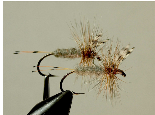
Virtually no difference in color.